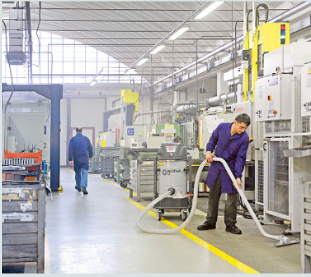
Cleaning of a metal company