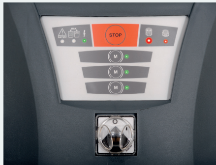
Electronic board control