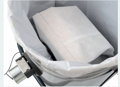
Optional safe bag