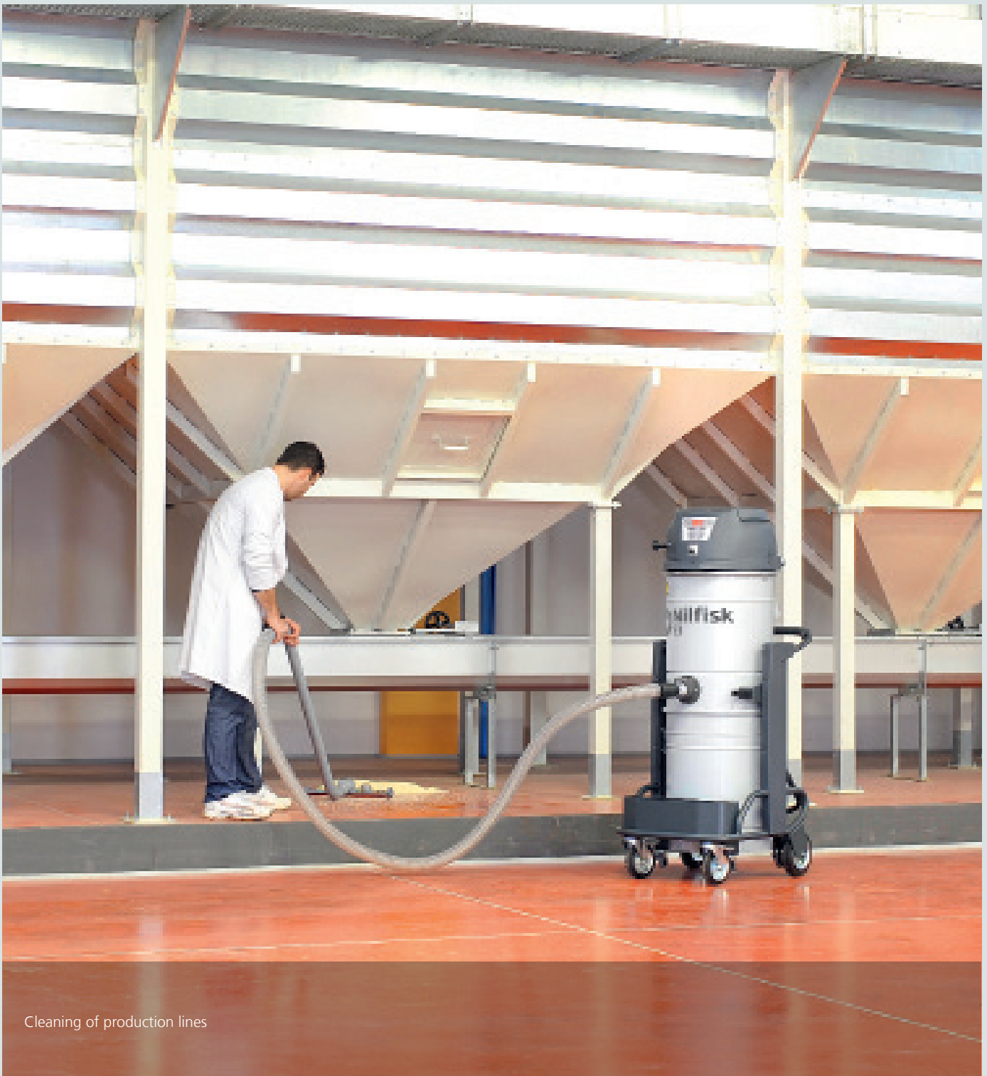
Cleaning of production lines