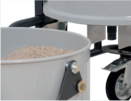
Solid cut-off system