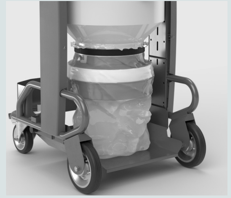
S3 with gravity unload system with Longopac®