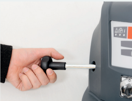
Manual filter shaker